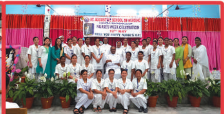
ST.AUGUSTINE'S SCHOOL OF NURSING CHIRANG, ASSAM "GNM 2019 BATCH"